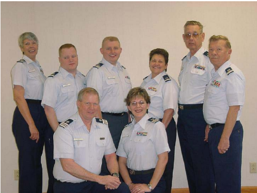
Division 30 South - Instructor's Workshop Graduates (21 Feb 04)