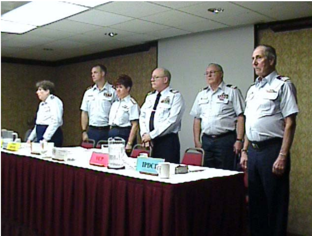
Division 30 Bridge, Change Of Watch 2004